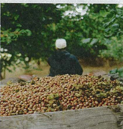
Freddy Guys Hazelnuts, Oregon