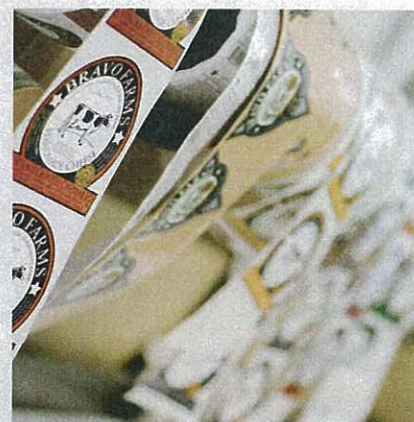
Bravo Farms, California