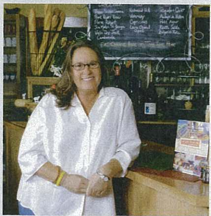
The Girl & the Fig, California