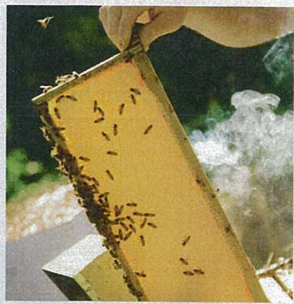
Honey Ridge Farms, Washington